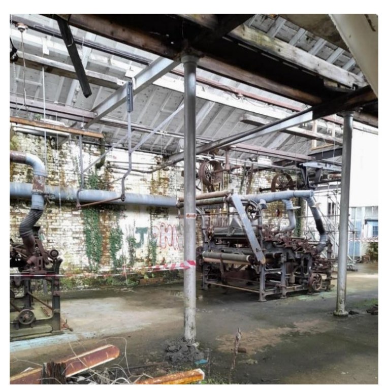
Inside the Tone Works with machinery still in place

It is excellent news that the restoration of this nationally important complex has been given further grant funding of £185,596 from Historic England.