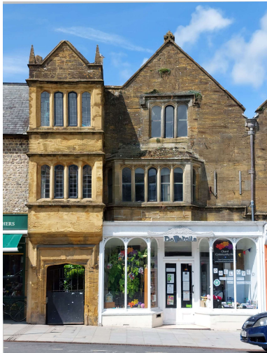
No 9 Fore Street , Chard, with a common entrance (left).

... is to engage with the diverse population of Somerset, tailor the repairs and alterations to this historically important building to suit a communal purpose for the widest benefit and ensure the best quality workmanship to secure the building for future centuries.