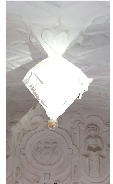
ABOVE: Ceiling central decorative plaster pendant in the Courtroom.

Multiple updates to background research material continues throughout.