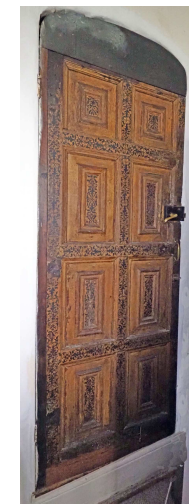
RIGHT: Ground floor fine timber door with ink decoration.