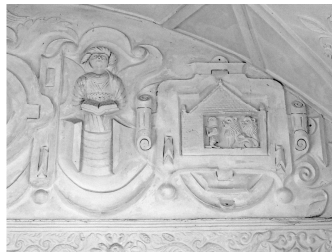
ABOVE: Part of the decorative panel in the Courtroom.

Local Film Company has released - Episodes 1 & 2 of Saving No 9 on the SBPT YouTube channel.