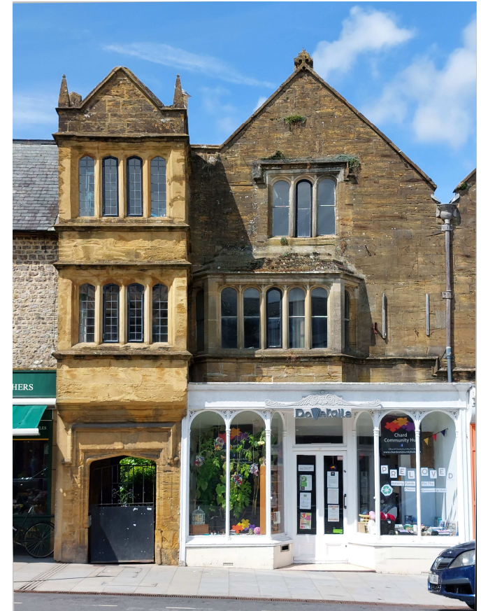
No 9 Fore Street, Chard, with a common entrance (left).

ABOVE: The white shop front currently 'The Hub - A Community Service Company'. No 9 is a Listed Grade 1 Elizabethan town house with first floor Courtroom containing a heavily decorated plaster ceiling all set behind this 'L' shaped three storey building.