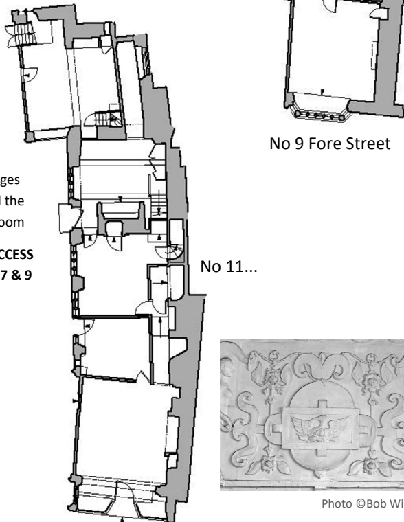
No 9 Fore Street