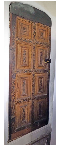
RIGHT: Ground floor fine timber door with ink decoration.