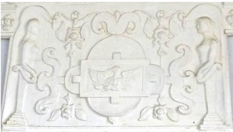
Detail from the nationally important plasterwork in the Courtroom