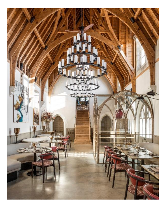
The Cockspire, Milborne Port

The Clockspire, Milborne Port – A Victorian school that has been brought back to life and is now a restaurant.