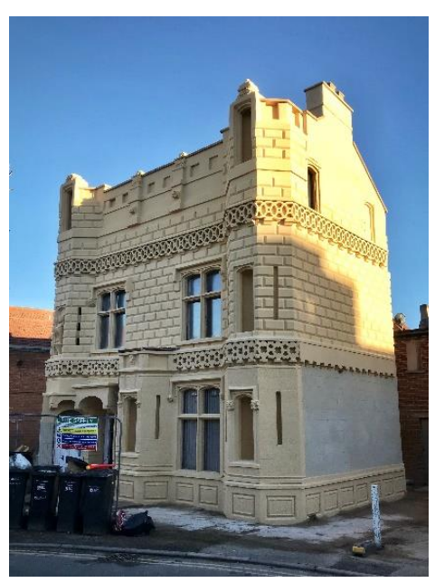
Castle House, Bridgwater

Tickenham Court, Clevedon - Careful research has resulted in a scheme that addresses issues of inappropriate earlier work together with 21st century intervention to enhance the spaces.